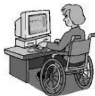
Eligibility for adult services differs from that used in public education

As the parents of a child with disabilities you are probably familiar with the services in the school system and other services mandated under Public Law 94-142. As you think about your child leaving school, you need to be aware that your child will be entering a different system of services which do not have the set of guarantees that are part of the Individuals with Disabilities Education Act (IDEA). Adult services have different entrance requirements and methods of operation, depending on the services your son or daughter will be seeking. It is very important for you as a parent to learn about the adult services alternatives and what you can expect to obtain for your child.